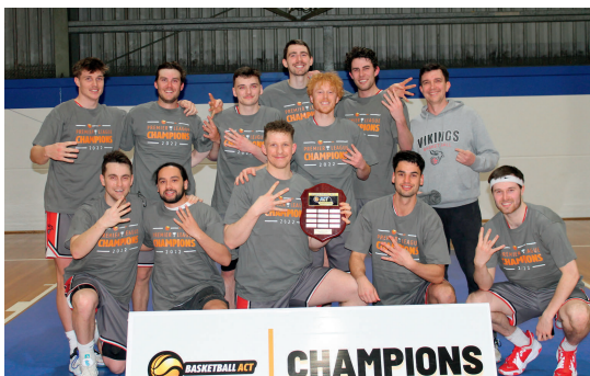
Premier 1 Men Champions- Tuggeranong Vikings

The Competitions Committee had a strategic focus around reviewing the Senior Premier League structure, in particular, the Premier League 1 Women's competition, which will continue into 2023.