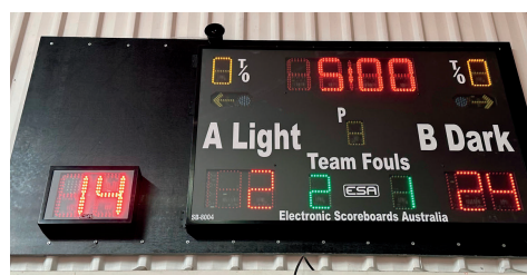
Scoreboard upgrades at Belconnen Basketball Stadium