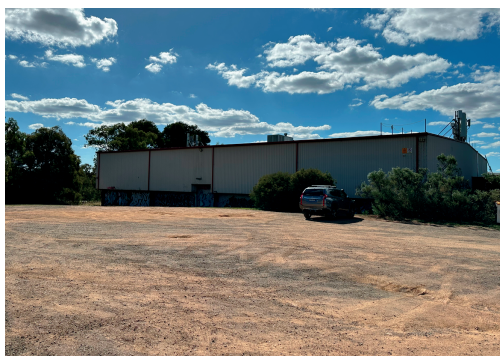
Proposed site for additional courts

The Facilities Committee have utilised the 2021-22 year to look at the potential expansion and utilisation of the space available at the Belconnen facility and BACT have pitched to the ACT Government for funding to expand the current Belconnen facility which would cost in the range of $20 million to $35 million. A facility of this size would facilitate the additional courts required based upon the current and longer term needs of the Canberra community.