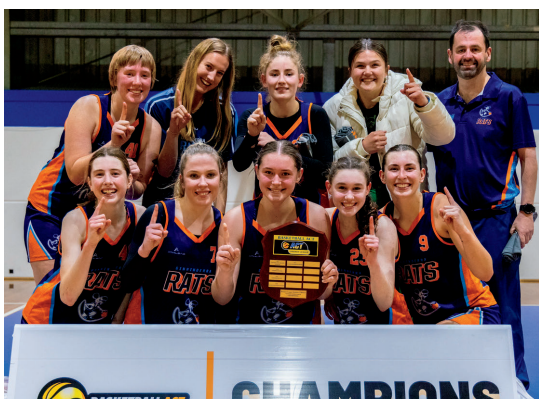
Premier 1 Women Champions - Ginninderra Rats