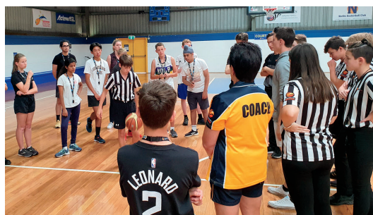
Community Referee (Level 0) Course participants