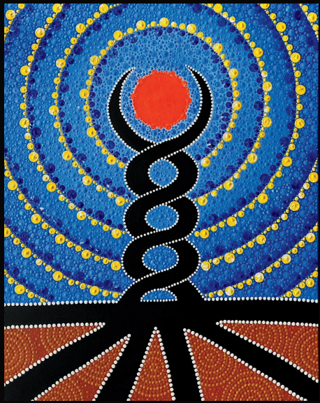
"HEALING TOGETHER"

We acknowledge and respect the continuing culture Aboriginal and Torres Strait Islander people make to the life of basketball within the city and region.