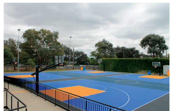
Outdoor 3x3 courts